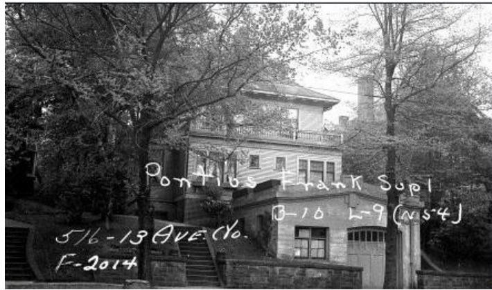
Ann Dunham's residence in Seattle, 1961